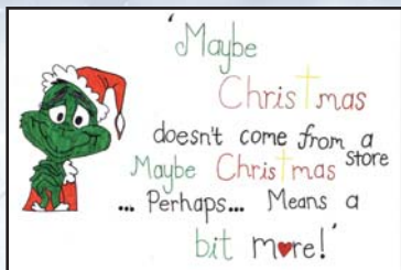
By: Yazmin Vega (age 17), Sunset Terrace