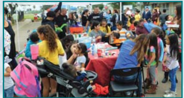
Children enjoyed face painting at the Resource Fair.