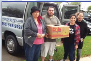
Elizarrarraz Family receives food donations.