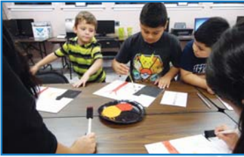
Children doing Christmas crafts