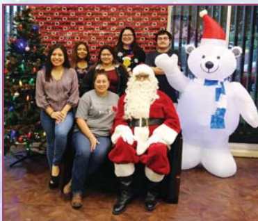
Los Vecinos Mentors visit with Santa.