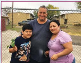
The Saldana family enjoying the community garden.