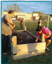
Community Garden participants

We are pleased to announce that our community vegetable gardens play an important role in helping our communities maintain a healthy lifestyle. Los Vecinos and Le Moyne Gardens have planted several yummy veggies like cauliflower, habanero chile, purple onion and many more. Planting and harvesting vegetables has helped residents distinguish the difference between store bought vegetables and organic vegetables. If you would like to participate please contact me at aquezada@harlingen-ha.com or at 423-6213.