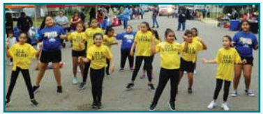
Resource Fair offers lots of entertainment.