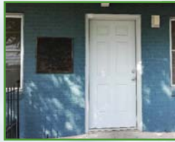
Bonita Park Exterior Door Replacement