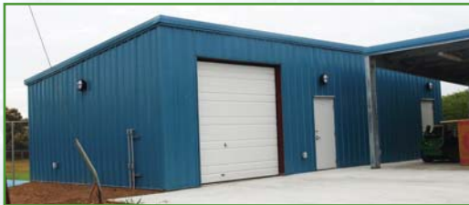
Bonita Park Warehouse and Awning