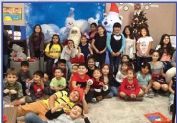
Santa visits Le Moyne Gardens Learning Center.