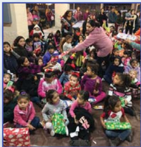
Livingway brings Christmas to Le Moyne Gardens.