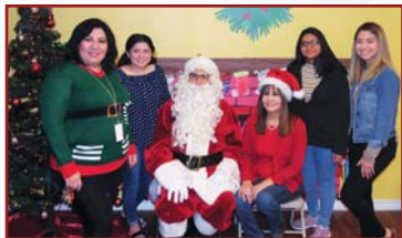
Santa visits Bonita Park residents.