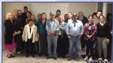
Residents enjoyed a Thanksgiving Feast.