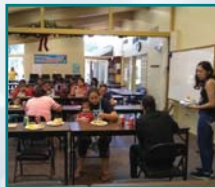
Los Vecinos Friendship Feast

On December 7th, we participated in the RGV Jaycees Christmas Parade. The theme for this year's float was "T'was the Night for Christmas Movies". We had the train from the "Polar Express" movie as our float. We are very proud of the outstanding participation from all our communities.