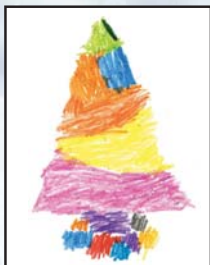
By: Cristo Moreno (age 7), Los Vecinos