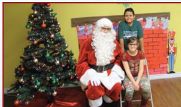
Bonita Park children are happy to see Santa.