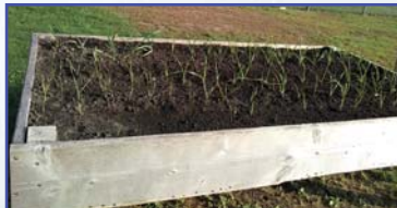
Fall planting in the Community Garden.