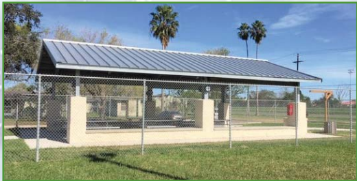
Le Moyne Gardens Pavillion