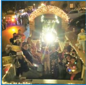
Residents riding in the Christmas Parade float