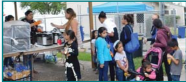
Great food at the Resource Fair.