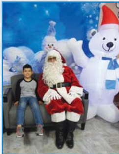
Santa visits the Family Learning Center.