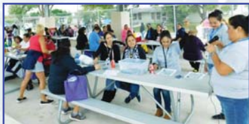
Our residents played Loteria while enjoying a light meal prepared by our Tenant Association and staff.