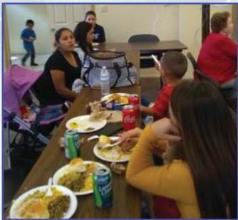
Le Moyne Gardens celebrates it's 1st Annual Friendship Feast.