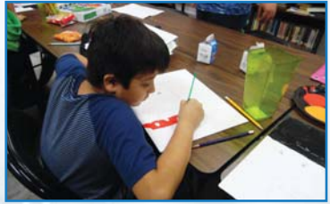
Acrylic Painting of a Snowman