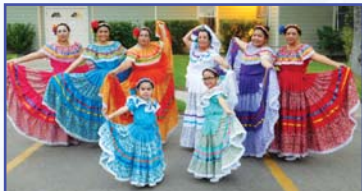
A group of Folkloric dancers performed at our Resource Fair.