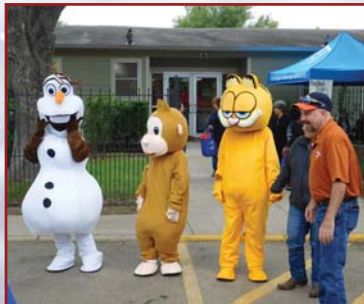
Some of our Student Mentors dressing up as characters for the Resource Fair.