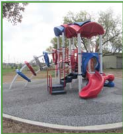
Le Moyne Gardens Playground