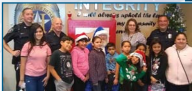
Harlingen Police Department Christmas Toy Drive

Our next meeting will be on Wednesday, January 23, 2019 at Los Vecinos at 10:00 a.m.