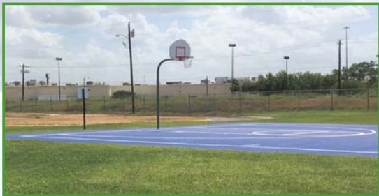
Los Vecinos Basketball Court and Landscaping