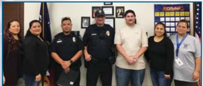
October 2018 Crime Prevention Meeting

The crime statistics for each of our communities were reviewed and ideas were shared on how we