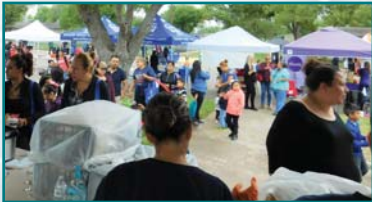
Great turnout for the Resource Fair.