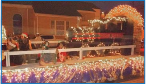
"Polar Express" themed Christmas Parade float