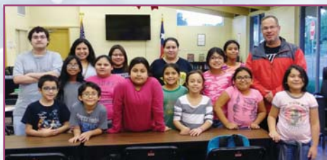
Los Vecinos Learning Center Coaches and Students